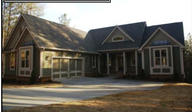
Private Wooded Lot

“The Orchard” Private Gated Golf/Tennis/Pool Community